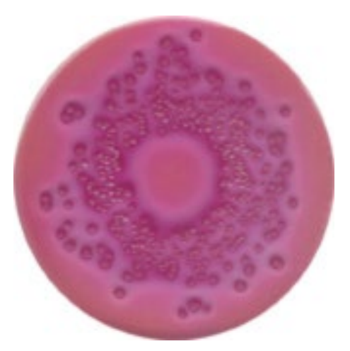
Escherichia coli ATCC® 8739